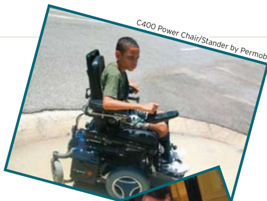
C400 Power Chair/Stander by Permobil