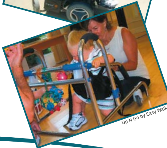
Up N Go by Easy Walking