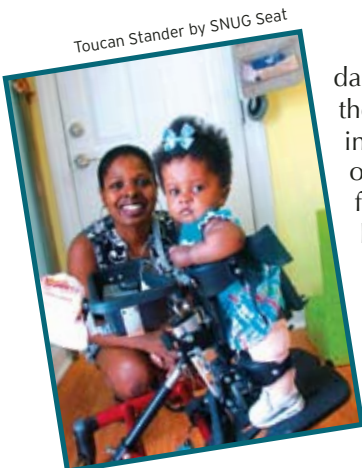
Toucan Stander by SNUG Seat