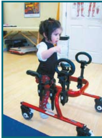
Rifton Mini Pacer and SPiO (spinal pressure input orthosis)